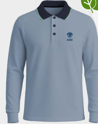
3194 Polo shirt in piqué cotton with recycled polyester fibers 37 00 $