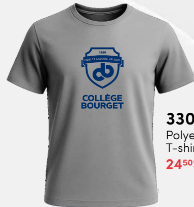
3307 Polyester jersey T-shirt 24 50 $