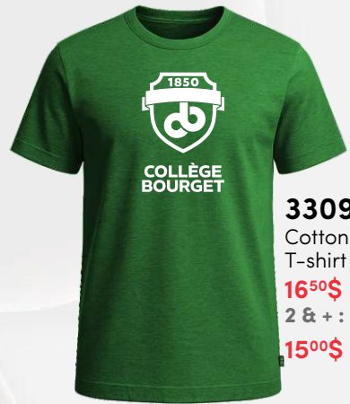
3309 Cotton T-shirt 16 50 $ 2 & + : 15 00 $ / unit