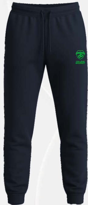
2306 Light fleece elastic cuffs pants 36 00 $