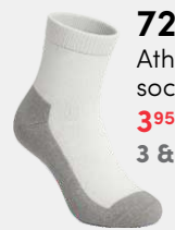
7201 Athletic socks 3 95 $ 3 & + : 3 50 $ / unit