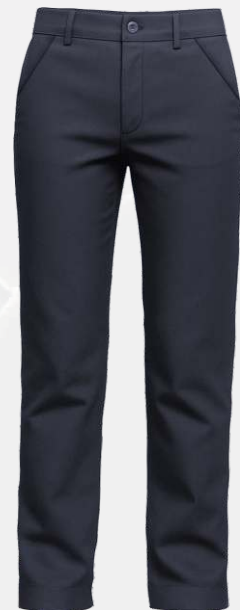
2250 Fitted cotton twill pants 56 00 $