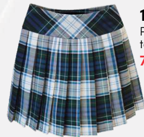
1254 Pleated tartan skirt 75 00 $