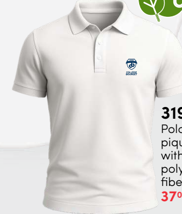
3197 Polo shirt in piqué cotton with recycled polyester fibers 37 00 $