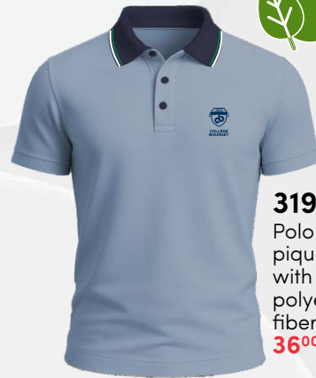
3197 Polo shirt in piqué cotton with recycled polyester fibers 36 00 $