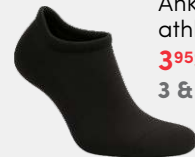
7205 Ankle athletic socks 3 95 $ 3 & + : 3 50 $ / unit