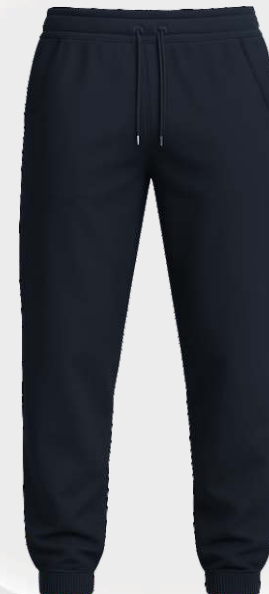
2130 Cotton twill jogger pants 54 00 $