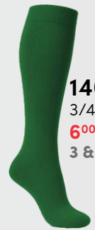
1404 3/4 Knee-high socks 6 00 $ 3 & + : 5 00 $ / unit

Prices are subject to change without notice