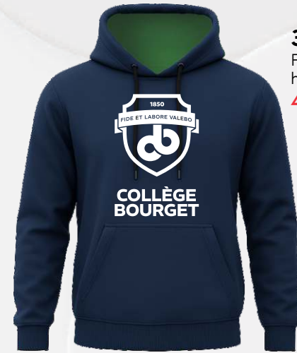
3401 Fleece hoodie 45 00 $