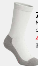
7203 Mid-calf athletic socks 4 95 $ 3 & + : 4 50 $ / unit