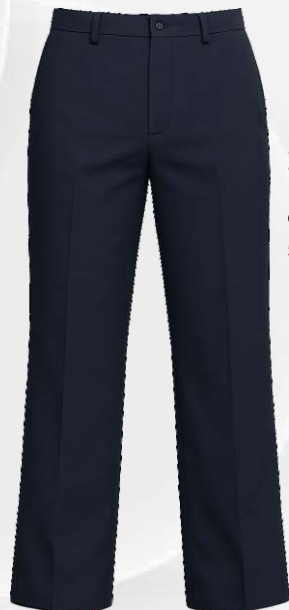
2235 High-waisted cotton twill pants 56 00 $