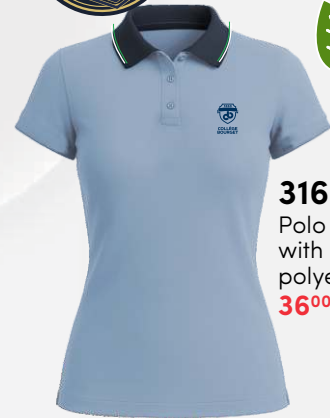
3169 Polo coton piqué with recycled polyester 36 00 $