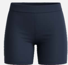
6040 Nylon-spandex modesty shorts 15 00 $