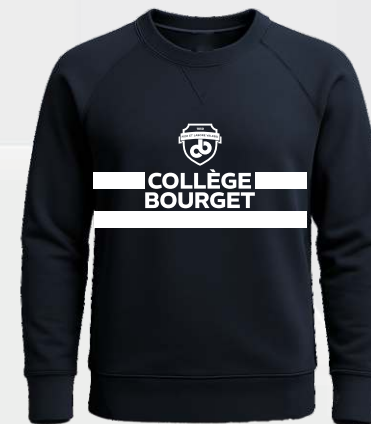
7710 Raglan crew-neck sweater 45 00 $