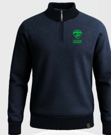
5415 Zip mock-neck knit sweater 60 00 $

Prices are subject to change without notice