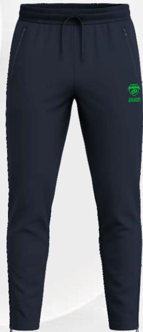
2370 Nylon pants with ankle zippers 49 50 $