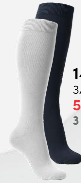
1404 3/4 Knee-high socks 5 00 $ 3 & + : 4 50 $ / unit