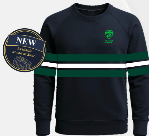
5440 Loose crew-neck knit sweater 60 00 $