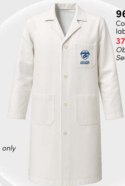
9602 Cotton twill lab coat 37 00 $ Obligatory Sec 1 à 5