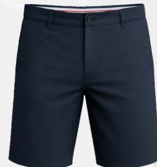
6102 Cotton twill golf Bermuda shorts 44 50 $ Adjustable size CHILD & JR