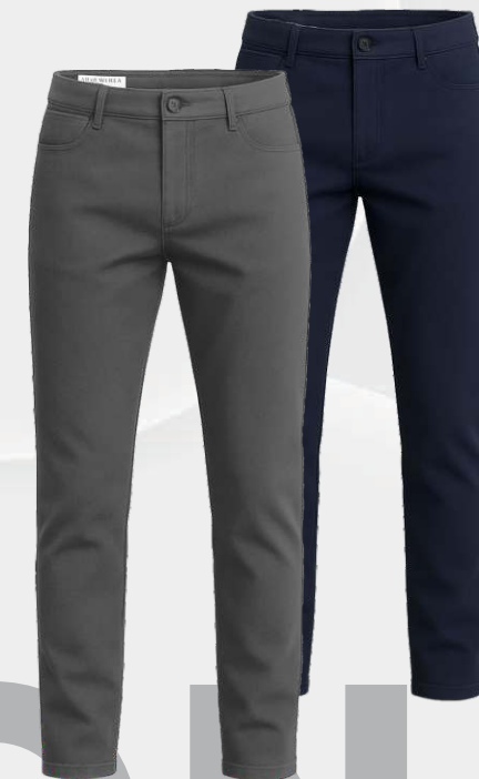
2117 Slim cotton twill pants 56 00 $ Adjustable size CHILD & JR