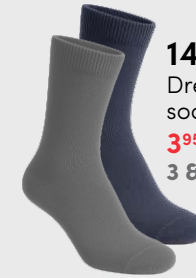
1401 Dress socks 3 95 $ 3 & + : 3 50 $ / unit